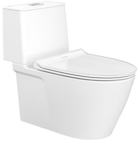
Acacia Supasleek Close Coupled 2.6/4l Cbr Cp Set Wt