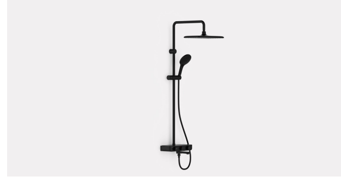
EasySET Exposed Auto Temperature Shower Matt Black