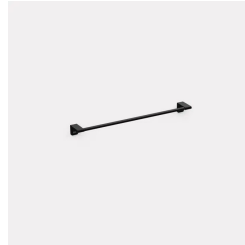
Acacia E Towel Rack_Matt Black