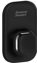
Acacia Supasleek Close Coupled 2.6/4l Cbr Cp Set Wt