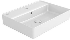
Acacia SupaSleek Vessel with Deck Single Hole