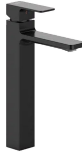
Acacia E SH SL vessel mixer_Matt Black