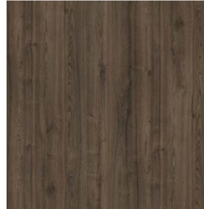
SHELF WOOD TEXTURE