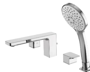
Deck Mount Bath & Shower Mixer with Shower Kit