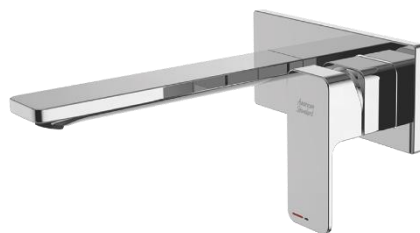
Wall Mount Mixer with Pop Up Drain