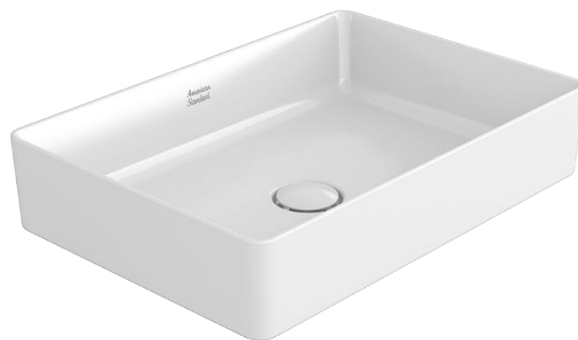
Vessel 550mm L380 x W550 x H110mm