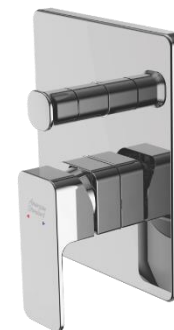
Concealed Bath and Shower Mixer

as:da american standard design award asia pacific 2022